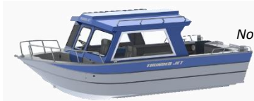
Note: Images shown may include optional features